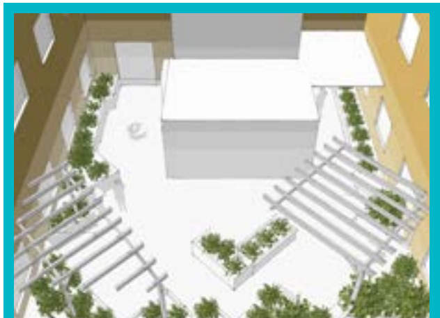
A rendering of the courtyard garden space

The project will be the biggest fundraising priority in the year ahead and we are incredibly grateful to the designers and builders who are providing their services at no cost to the Charity.