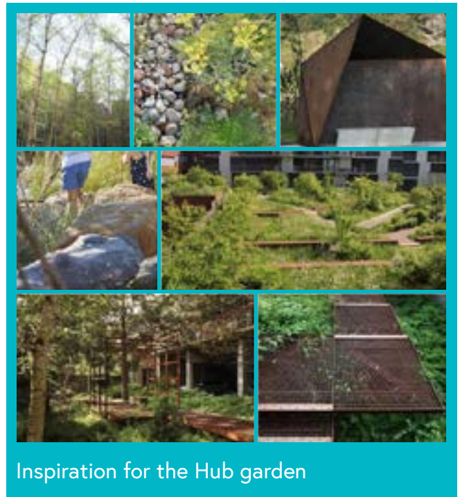
Inspiration for the Hub garden

More than 350 families visit the Hub each week and services include autism assessments, child protection medicals, speech and language therapy, physiotherapy, health assessments for children in care, care for children with special educational needs and disabilities, and pre- and post-natal support for pregnant women and