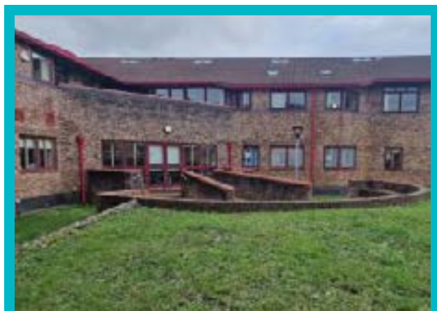
The unused green space outside the Hub

In 2022, Whittington Health created the Haringey Children and Young People's Health Hub (the Hub) in east Haringey, bringing together children's services from across the borough.